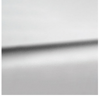
Stainless Steel Inox - SST

Digital: Not all screens are calibrated the same, and therefore, colors will appear differently between screens.